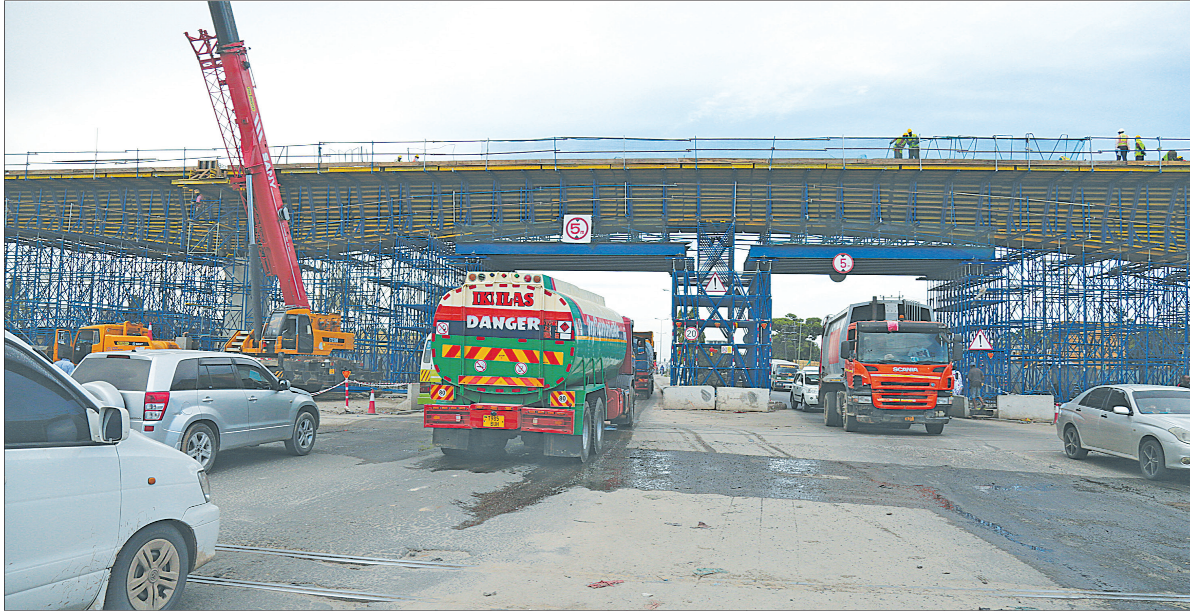
CONSTRUCTION of Standard Gauge Railway bridge that crosses at Nelson Mandela Expressway continues at Buguruni area in Dar es Salaam as captured yesterday. The first phase has six main stations at Dar es Salaam, Pugu, Soga, Ruvu, Ngerengere and finally Morogoro.

In addition to the 100 photo-stories from all six continents, The Other Hundred Healers features essays from writers and thinkers from different parts of the world.